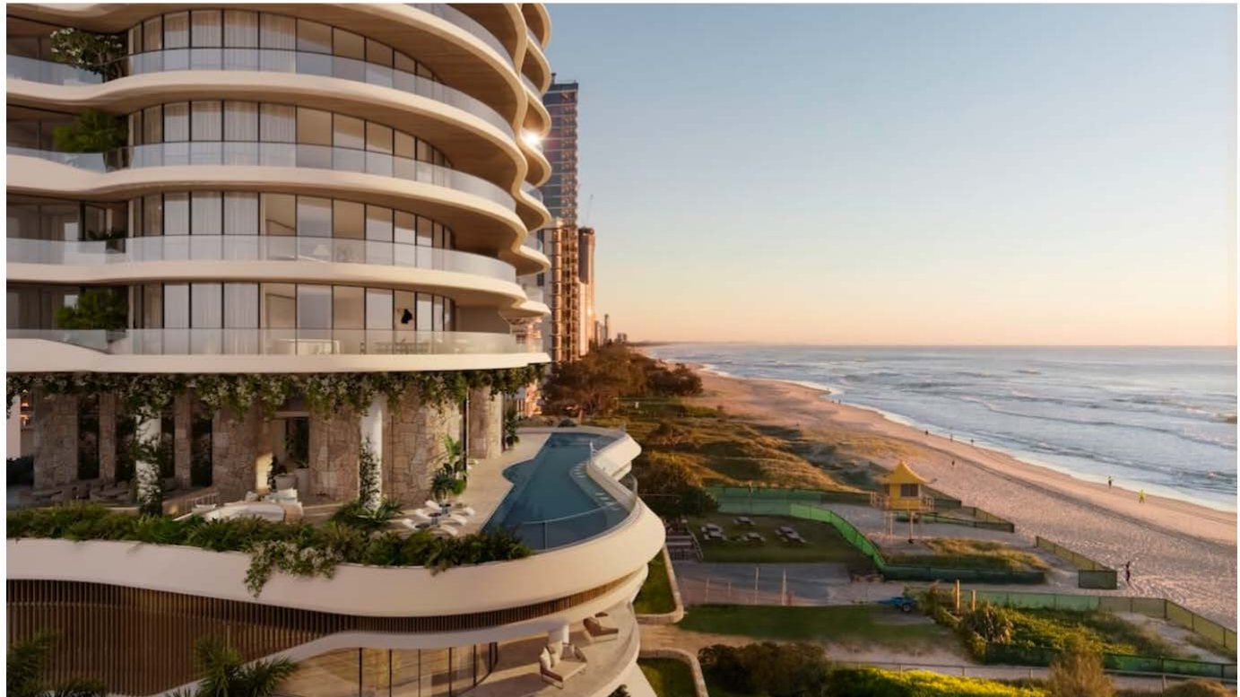
Coast's facade, looking over the beach.